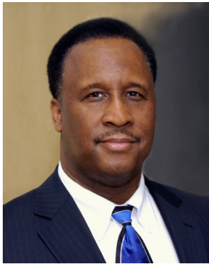
Hon. James T. Butts

As Mayor, he loves Imperial for its vibrancy and visionary people, incredible cultural and intellectual life, diverse neighborhoods and the history of trailblazing leadership.